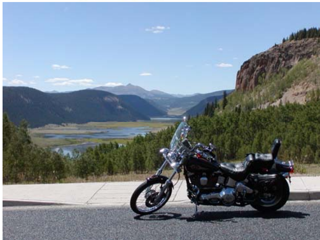
Where the Rio Grande River begins, Creede, CO. Highway 149 and Slumgullian Pass were perfect.

But alas, after several days of non-stop riding and eating, me and my riding buddies, Tommy Martin and Jimmy Groce, decided to spend a few days in beautiful Colorado.... We weren't disappointed. I've been in all the states but five, I've been in beautiful western Canada too, but mile for mile it doesn't get any better than Colorado.